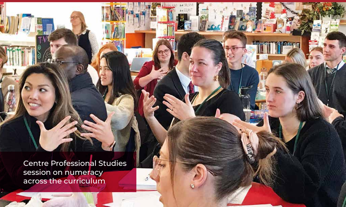
Centre Professional Studies session on numeracy across the curriculum

“ The support from GITEP is excellent: they always take the time to listen and are only an email away if you ever have a problem. I also had amazing mentors at both of my placement schools. They had high expectations but took the pressure off by making it clear that perfection can take a few years. ”